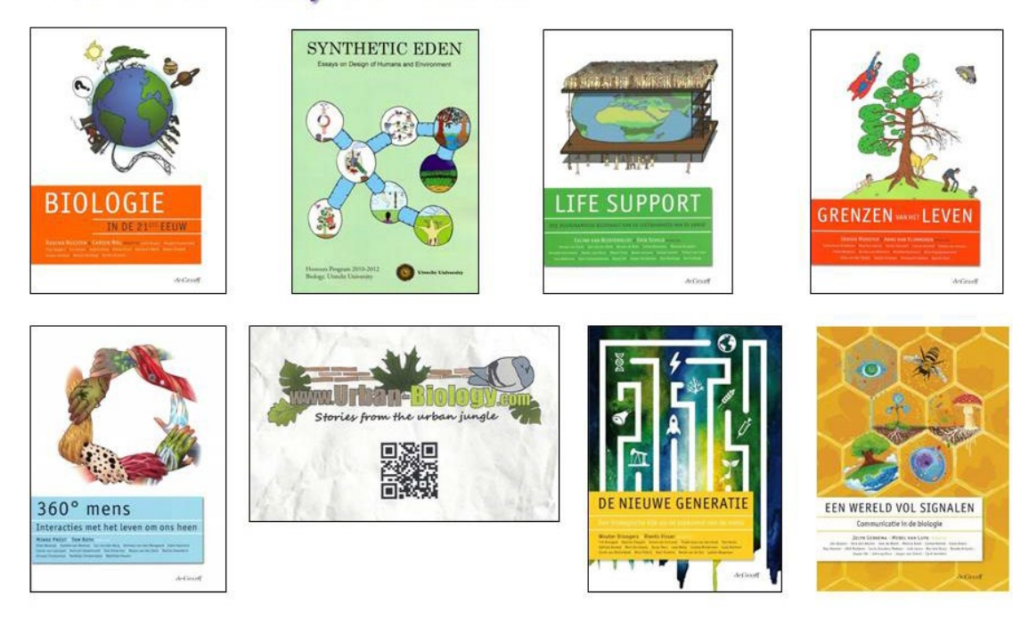
Figure 1. The covers of the popular science books as well as a website that have been produced by honors students at the Department of Biology, Utrecht University, over the past 8 years. Most books are available at Uitgeverij de Graaff in Utrecht, The Netherlands.